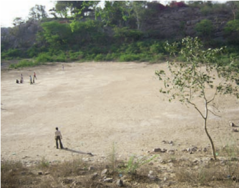
Photograph 2: Dry Badkhal lake bed

Pollution Control Board (CPCB) and Haryana Pollution Control Board. However, mining is such as flourishing and lucrative economic activity that the activity continues unabated and government has failed to take appropriate steps to ban/regulate mining. Right now both Surajkund and Badkhal lakes are in a degraded dry condition.