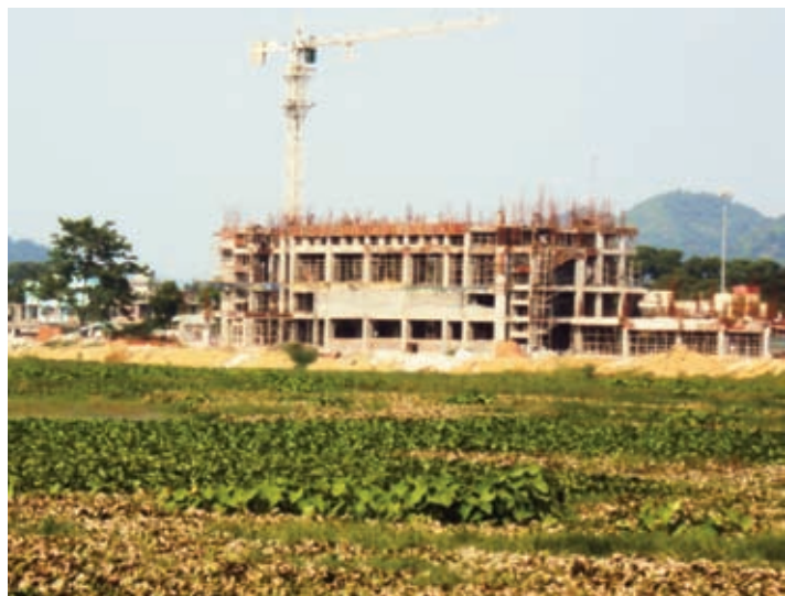
Photograph 3 : A building constructed in the middle of Deepor beel, Guwahati, Assam

Besides functioning as a major rainwater storage basin for Guwahati, Deepor beel has an immense biological and ecological significance. It was designated as a Wildlife Sanctuary in a preliminary notification in 1989 and was declared a Ramsar site in 2002. The beel is also an important staging site for migratory waterfowl. The waterbody is a home to a large number of vegetation and animals, including some endangered species such as spotbilled pelican and greater adjutant stork. However, the high biodiversity of the wetland ecosystem is being threatened due to degradation in water quality, illegal poaching and considerable human-induced disturbances.