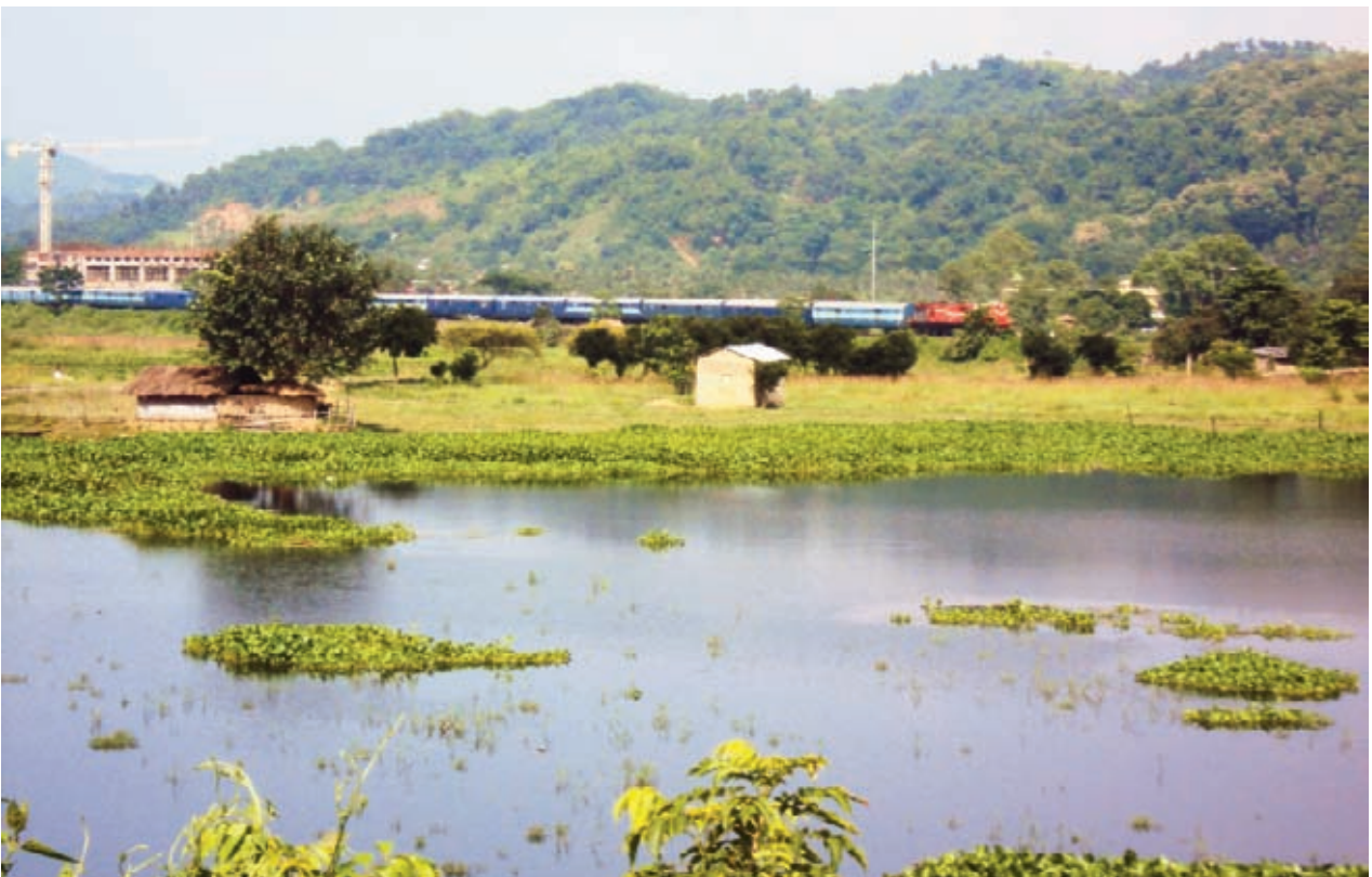
Photograph 5 : Encroachment of the Deepor beel by railway tract, Guwahati, Assam