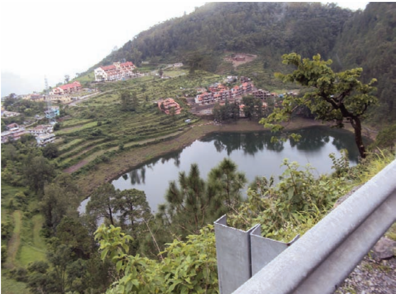
Photograph 6: Upcoming housing project near Khurpatal, Uttarakhand.

the Army Welfare Housing Organization (AWHO). The builders have bored in the adjacent areas of the lake in 2002 and since then the lake water started to decline. Residents of at least seven villages downhill of the lake are facing water shortage because of the project. They observed the reduction in the flow of water in their springs first in the summer of 2003, a year after AWHO began construction work on its colony of 80-housing units. The spring flow in these villages become negligible during the lean period and most people in the area have already abandoned farming and started migrating for contract labour 8 . Dr. Ajay S. Rawat, Professor of History in Kumaon University was successful in bringing the case to the notice of Uttarakhand High Court in 2009.