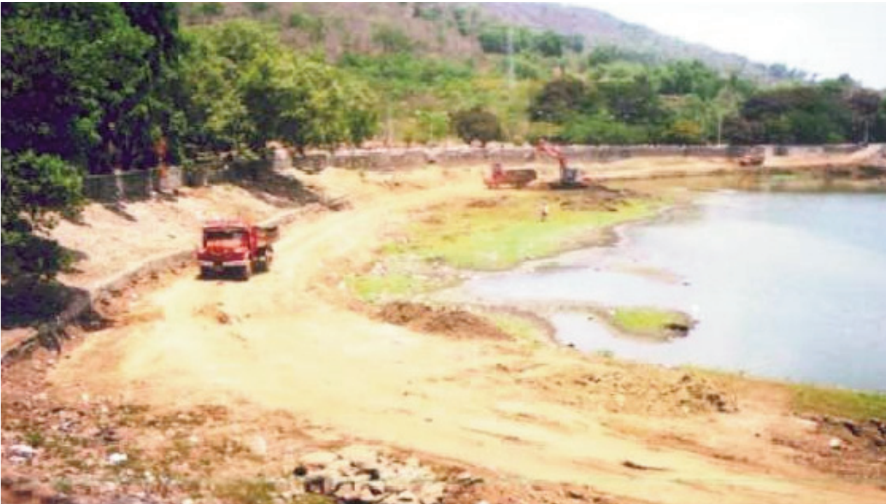
Photograph 9: Upvan lake before the restoration process