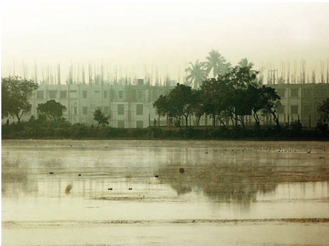
Photograph 7: Construction near the Ousteri lake, Puducherry, February 2006

21 NGOs in Puducherry formed the Ousteri Protection Coordination Committee (OPCC) in order to save the waterbody. In 2006, OPCC protested against the Environment Impact Assessment report submitted for the project clearance. OPCC also filed a PIL in the High Court of Tamil Nadu against the Union of India, PWD, Pondicherry Pollution Control Committee and the Trust, regarding the illegal construction of Medical College and Hospital adjacent to the Ousteri Lake. The case is pending in the court for more than five years. The college has already started functioning. In spite of all the efforts by the civil societies, the movement is facing an uphill battle because of absence of any administrative framework to protect the waterbody.