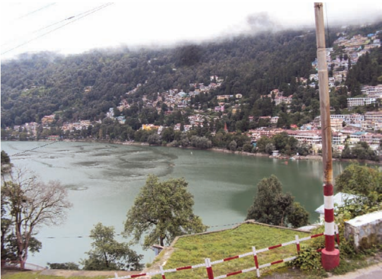
Photograph 8: Conserved Naini lake, Nainital, Uttarakhand

Source: Rawat, A.S. and Raju, S. 2010. Nainital Beckons . 60 p.