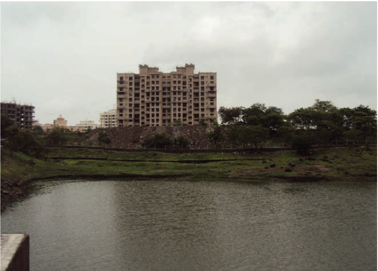
Photograph 10: Restored Upvan lake