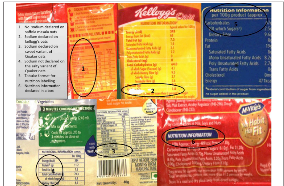
Figure 2: Illustration of difference in labelling on package and website (per serving and sodium)