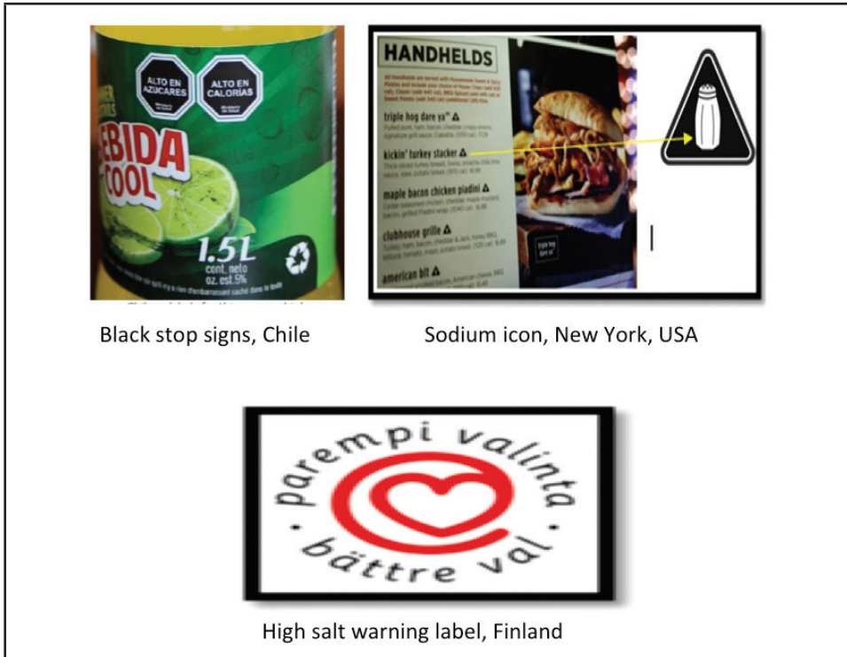
Black stop signs, Chile