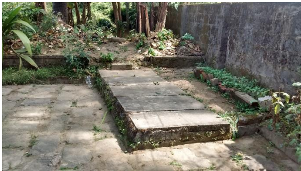
Figure 1: Two chambered septic tank connected to soak pit of a household

Containment: There is no household connected to functional underground drainage system. Most of the households in the city (60%) are dependent on three chambered septic tanks connected to soak pits. Whereas the rest (36%) are dependent on pit latrines constructed with concrete rings or granite stones with open bottoms. Sizes of containment systems depend on space availability and affordability of the households. The septic tanks are constructed according to the Kerala Municipal Building Rules (KMBR) 1999. About 4% of population defecates in open. It is mostly practiced tribal areas and near riparian of River Moniyangod. There are three public toilets catering tourists, visiting the city, and seven community toilets catering the local residents deprived of individual toilets (KM, 2016).