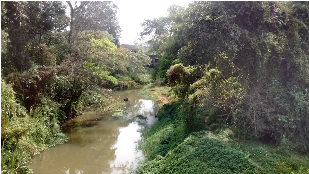
Figure 4: Picture showing a drinking water well and spring water used by residents living in plains and hilly area

Most of the HHs dependent on OSS, do not discharge any wastewater in drains. Nevertheless, sample HH survey revealed that some of the HH located on the riverside discharge their grey water in the stream called Moniyangod River, which emerges from the hills and flows through the city.