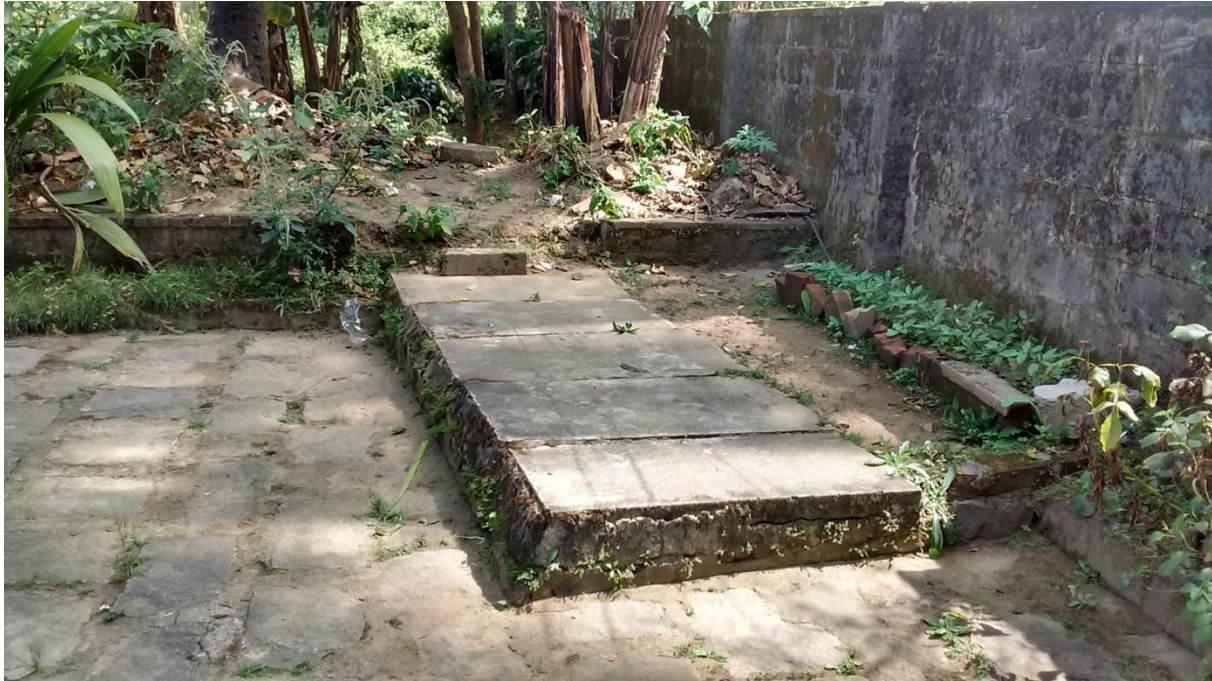
Figure 2: A three chambered septic tank connected to soak pit of a HH

Around 4% of the population still practices open defecation. These are mostly practiced in the wards occupied by urban poor and the wards in proximity to the River Moniyangod.