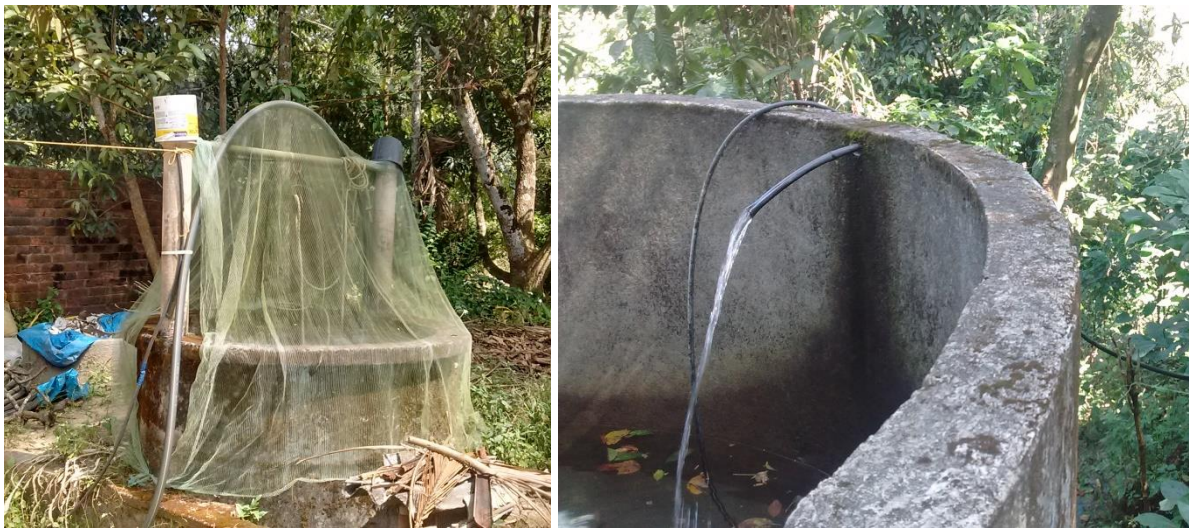
Figure 3: Picture showing a drinking water well and spring water used by residents living in plains and hilly area

Septic tanks are connected to soak pit but still are 'not contained' as the residents consumes the groundwater from the open wells in their respective premises and the same goes for the pits constructed with concrete rings. Whereas, pits constructed with granite stones and the pits which are usually abandoned when full (regular practice in the hilly areas) have been taken as 'contained', as the people on hilly areas are dependent on natural streams of water rather than groundwater.